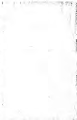
DOROTHY VAN SLYKE ... asks support

She said 400 people signed the petition at the main library Thursday and reports from Stamford and Drummond branches were more than 200 and 123 respectively. No figures were