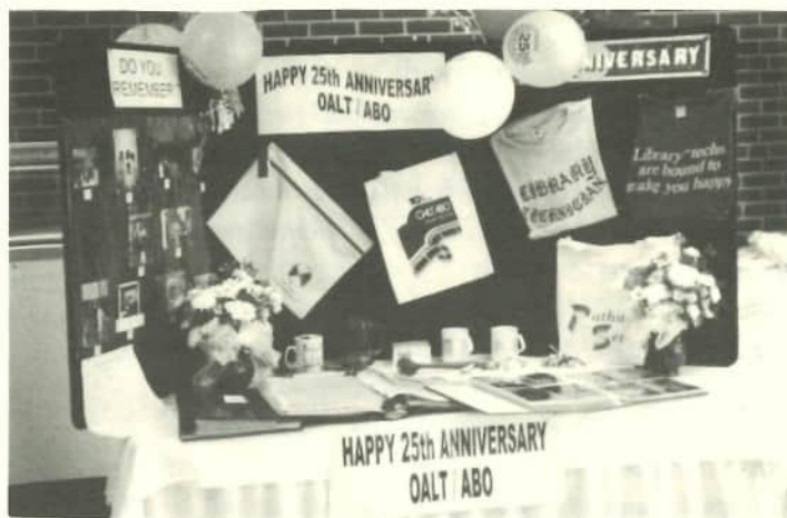
Happy 25th Anniversary OALT/ABO Display