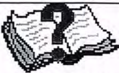
Table of Contents/ Table des matières

P.O. Box 1094, Station/Succ. "B" Ottawa, ON K1P 5R1