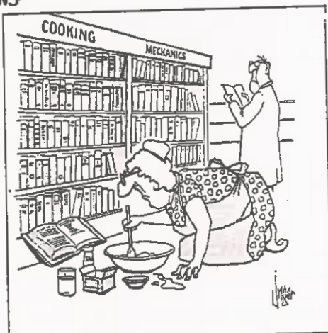
From: The 1st Treasury of Herman by Jim Unger. Andrews and McNeil, c1979.

File # NR-195 Ministry of Natural Resources Main Office Services Section Personnel Services Branch Room 4601 Whitney Block Queen's Park Toronto, Ontario M7A 1W3