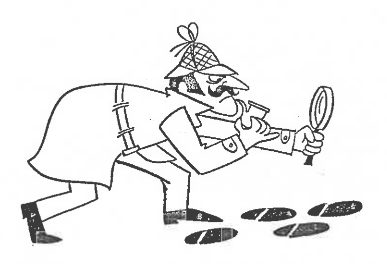
Look for Membership statistics

The evening was a success. Perhaps we'll make this an annual meeting place.