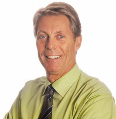
Fred Eisenberger Mayor