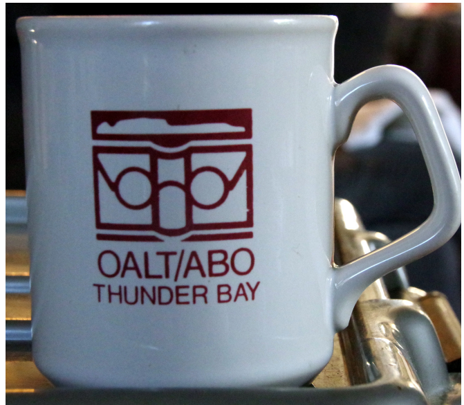
From the archives: a mug from a previous OALT/ABO Conference held in Thunder Bay, Ontario