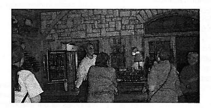
Enjoying the scenery and the beverages on the wine tour