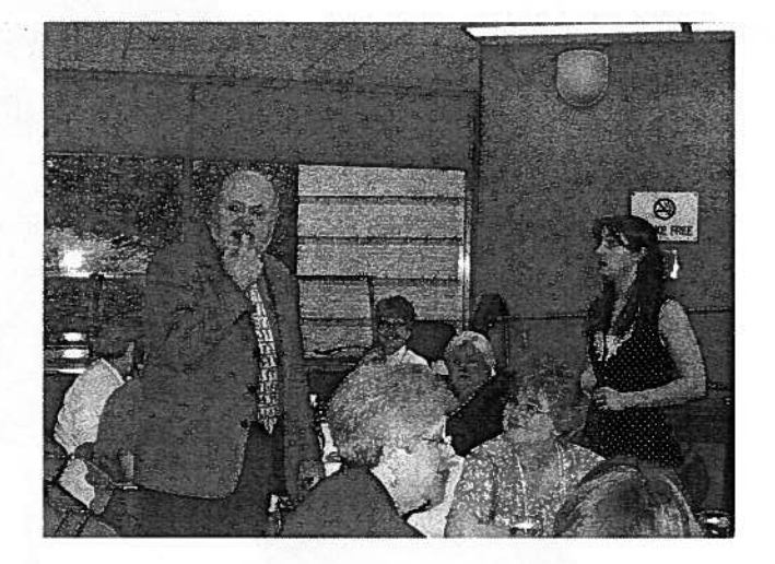
Who was the murderer at our banquet?