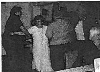
Work is done, let's have fun!

One of the highlights of the conference was the tour to the Shaw Festival, where we met the librarian for a talk on the history of the Festival, and how their library is managed. This was followed by a back-stage tour, under the stage, through the dressing rooms, and into a rehearsal room. Our dinner night out was held at Oh Canada, eh?, a historical look at Canadian history in the setting of musical dinner theatre. The food was great, and we had a lot of laughs.